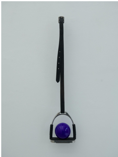
Anna Walther Winner's Circle Stirrup, blown glass 77 x 15 x 7 cm 2023