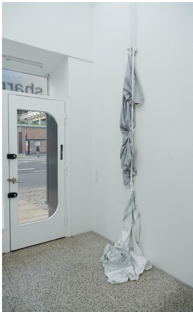
Julia Znoj 9th street drape Vinyl cloth, laser-print transfer Dimensions variable 2022