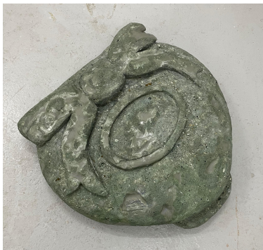
Julia Znoj Jailed for freedom Mixed media, acrylic paint 19 x 70 x 74 cm 2021