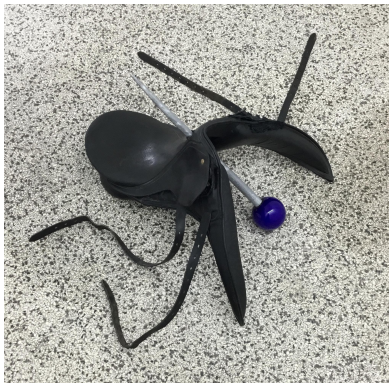
Anna Walther A Needle Will Drop Horse saddle, ceramics, blown glass 120 x 70 x 42 cm 2023